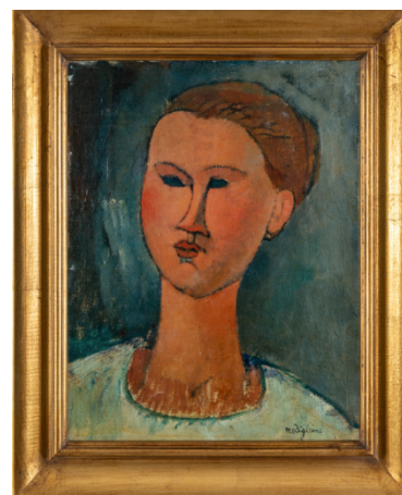
Amedeo Modigliani Head of a Young Lady , 1915 (46 x 38 cm) Original: Pinacoteca di Brera Digital Artwork (DAW®)

The show will host an installation by Giuseppe Lo Schiavo , whose research aims to investigate the relationship between elements in opposition: creation-destruction, past-future and real-virtual. Upon entering the gallery, the viewer will immediately feel transported to another dimension especially because of the material used by the artist: the thermal blanket, fragile but durable and rich in meaning. This material originally developed by NASA is used to relieve migrants and homeless people out of the cold, but in its artistic meaning also in reference to global warming. The works presented within the installation are sculptures that combine this material, cut out with surgical precision, to the extent that the artist uses a scalpel, and placed inside two sheets of plexiglass thanks to electrostatic charges.