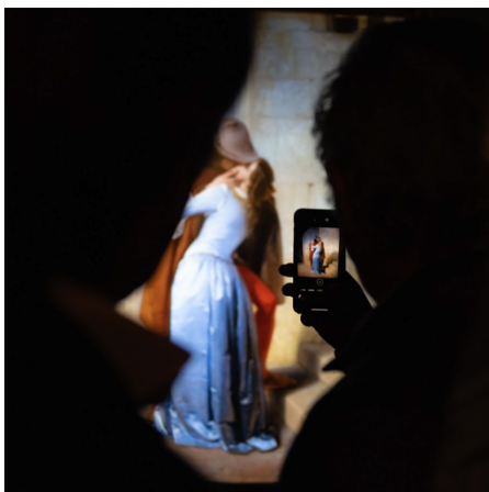
Francesco Hayez The Kiss , 1859 (112 x 88 cm) Original: Pinacoteca di Brera Digital Artwork (DAW®)

Espinasse31 is pleased to announce its collaboration with Cinello , an Italian company committed to the delicate task of promoting and enhancing the artistic heritage on a national and international scale; with its patent it is able to protect digital files of artworks from museums, private collections and contemporary artists, guaranteeing their originality and non-copyability. Cinello has opened the door to a new form of art fruition and collecting, thanks to DAW® - Digital Art Work , digital works of art in very high definition, numbered and authenticated. On the occasion of the Milan exhibition, it will be possible to admire digital versions of great Italian masterpieces such as Modigliani's Head of a Young Woman and Hayez's The Kiss , the originals of which are on display in the Pinacoteca di Brera museum in Milan.