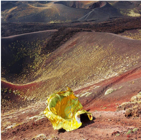
Giuseppe Lo Schiavo Wind sculpture-Etna 04, 2017